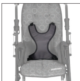
H-style harness CLASSIC