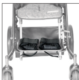
Feet fixation - pair