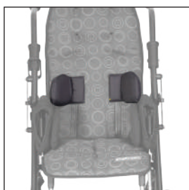
Side trunkrest CLASSIC