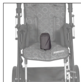
Abduction block CLASSIC