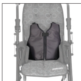
Immo. Waistcoat CLASSIC