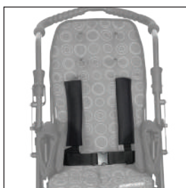
4-point immobilisation belt CLASSIC