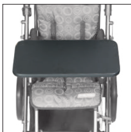
Work board BASIC - UNI