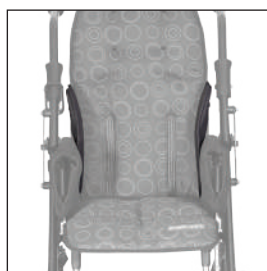
Hip rest CLASSIC