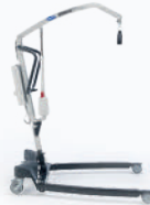
Birdie EVO PLUS

▶ Smaller footprint for easier maneuverability