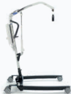
Birdie EVO COMPACT

▶ Smaller footprint for easier maneuverability