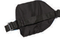
Soft Adj. Lateral Support