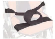
Lateral Thigh Support (Adductor)