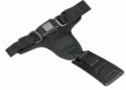
3-Pt Positioning Belt with Depth Adjustable Crotch Strap (Transit Required)