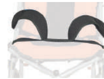
Medial Thigh Support (Abductor)