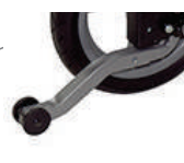
Rear Anti-tip Tubes