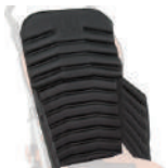
Reducer Seat Insert