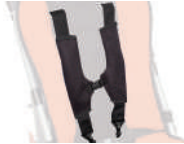
H-Harness with Padded Covers (Transit Required)