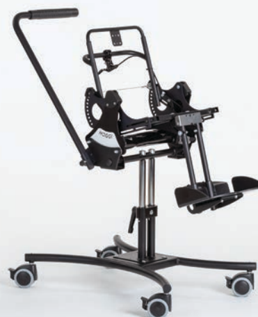
With seat frame & back base.