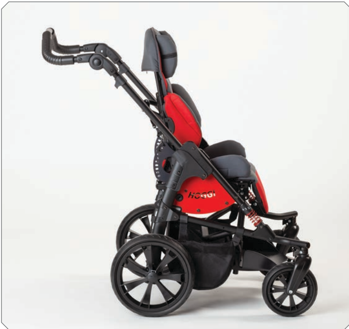
HOGGI laser cut side covers.