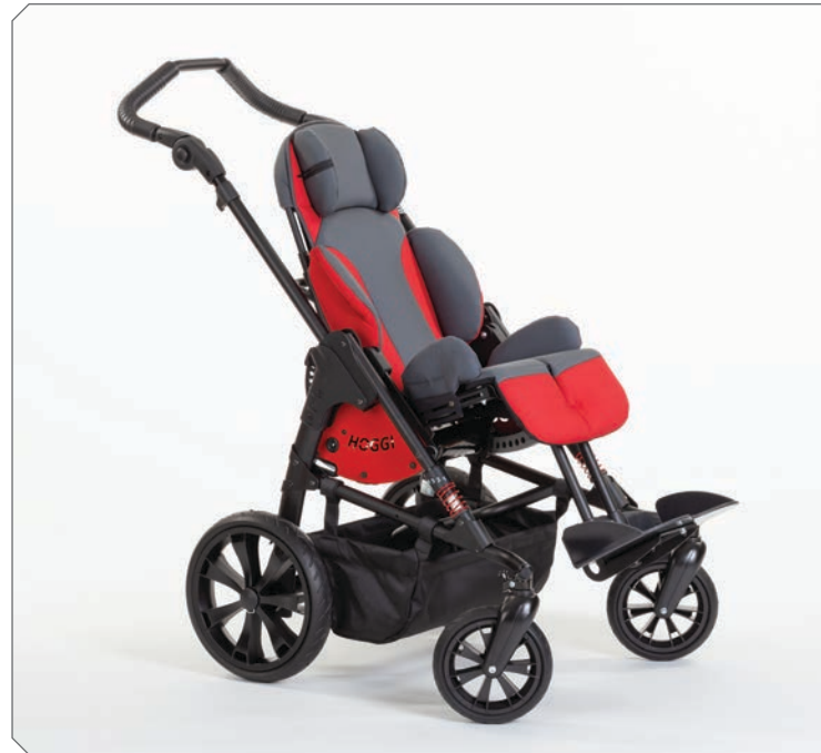
Compact. Light. Sporty.