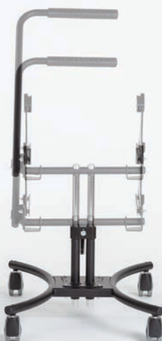
Height adjustable range.