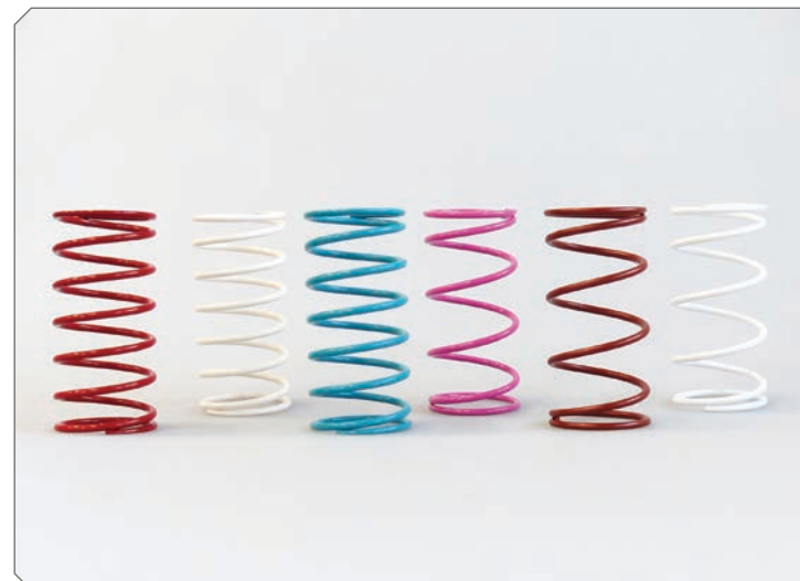
Spring sets in different intensities.