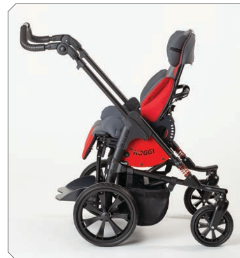
Seat unit against driving direction.