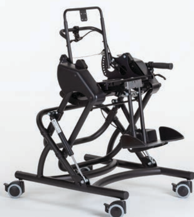
With seat frame & back base.