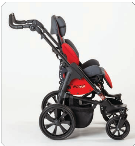
Seat unit in driving direction.