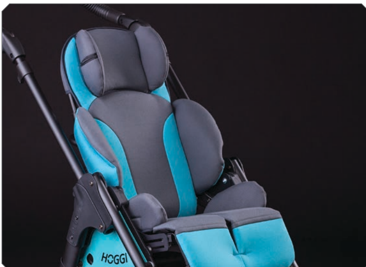
Frame suspension system.