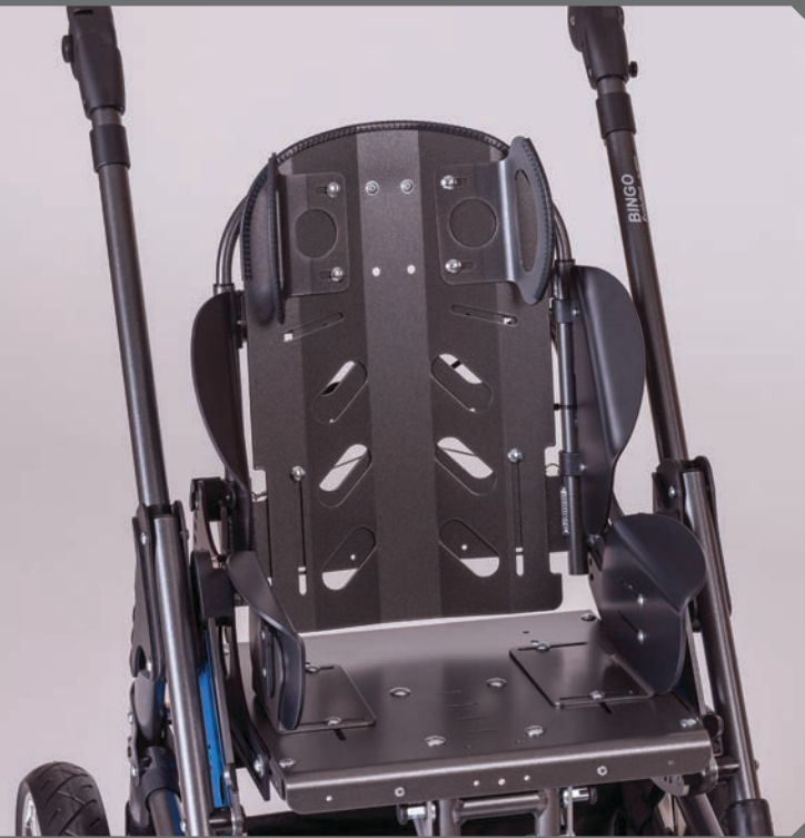
Multiple adjustment possibilities.

The multifunctional seat unit offers individual adjustment possibilities for your child thanks to a wide range of supports.