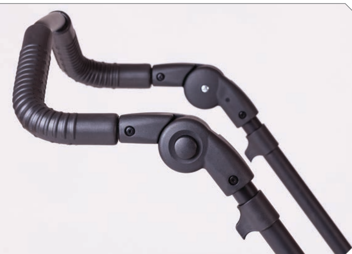
Height adjustable push bar.