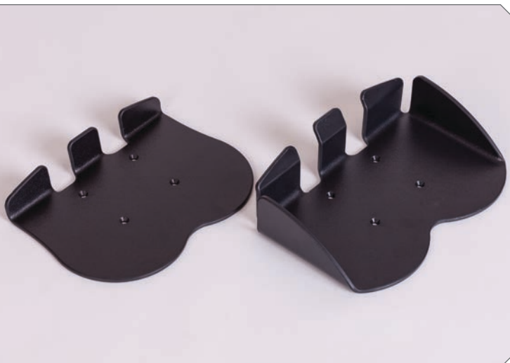
Variations of foot plate.