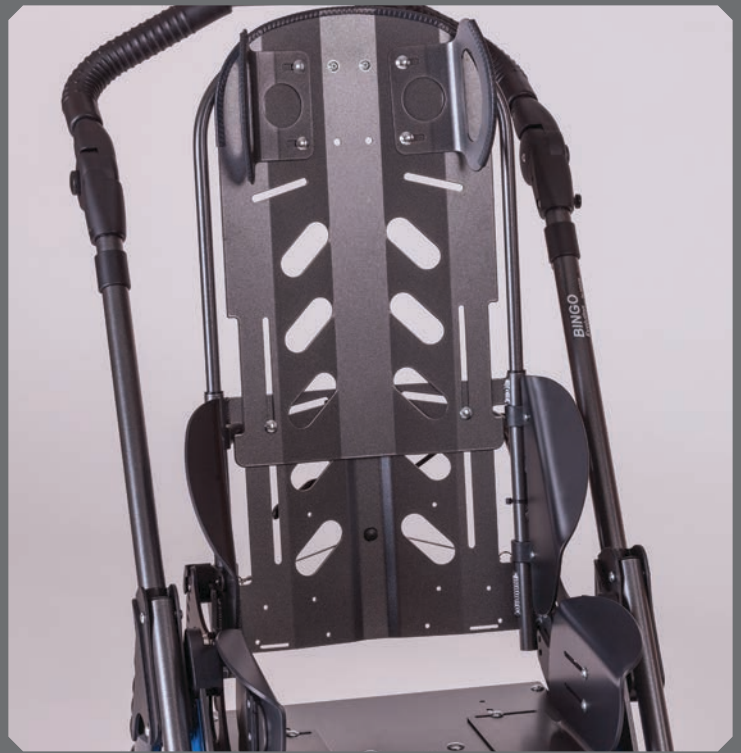
Huge growth capacity.