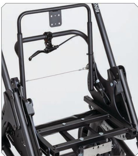
Seat frame & back base.