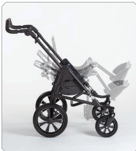
Adjustment range tilt in space.