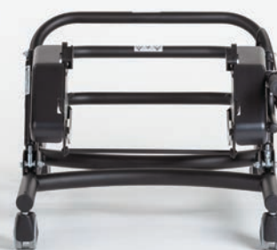
COBRA, lowest position.