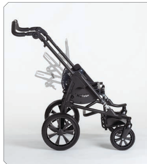
Adjustment range recline.