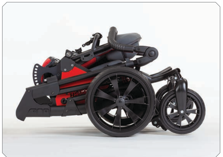
Compact folding size.