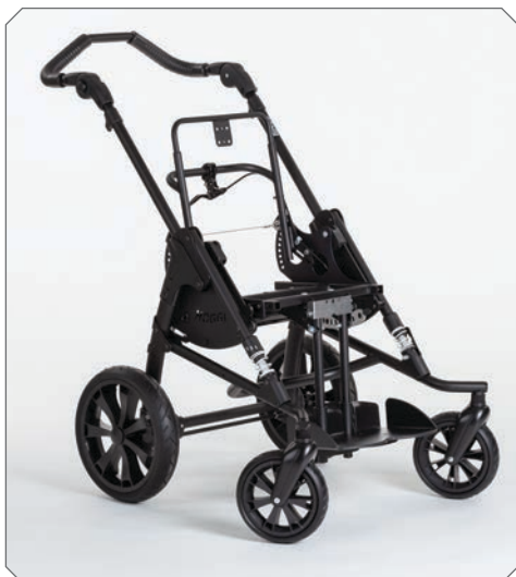
BINGO Mobility frame.