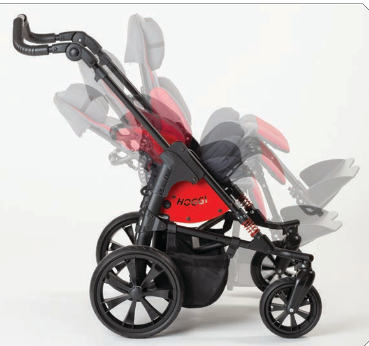
Tilt in space.

High seat comfort thanks to tilt in space and recline.